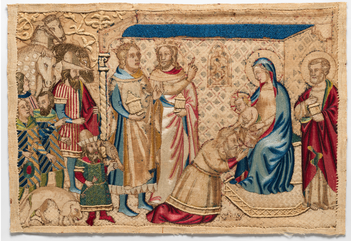
The Adoration of the Magi

Note. The Adoration of the Magi . Italian, late 14th century. Material include linen and cotton plain weave with linen plain weave, embroidered with silk and gilt-metal-strip-wrapped silk in bullion, split, and stem stitches, laid work, couching, and couching padded with cotton. Underdrawing and wash in sepia ink. Edging is hemp plain weave. Robert Lehman Collection, 1975. The Metropolitan Museum of Art. CC0 Public Domain Designation.