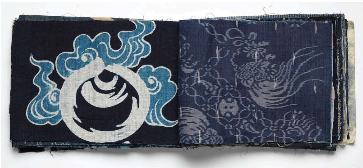
Figure 8 Japanese sample book

Note. Japanese sample book. Materials include hemp, cotton, linen, indigo, paper mulberry bark. 19th-20th century. Cotsen Textile Traces Study Collection. The George Washington University. CC0 Public Domain Designation.