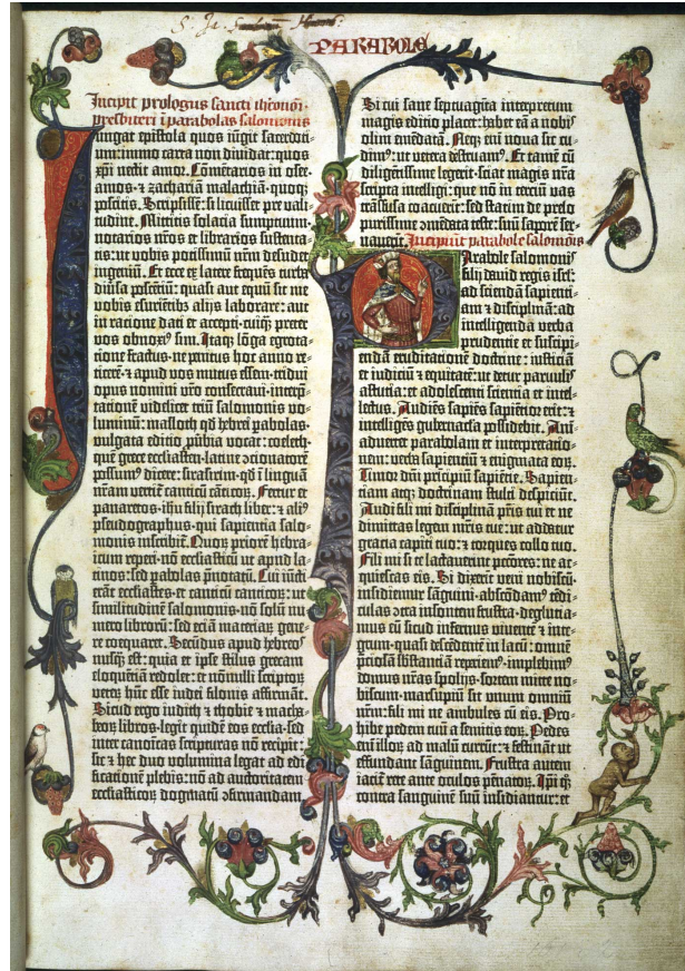
Note. Biblia latina, 42 lines, (Mainz: Johann Gutenberg and Johann Fust, about 1455). On paper. British Library. CC0 Public Domain Designation (Gutenberg & Fust).