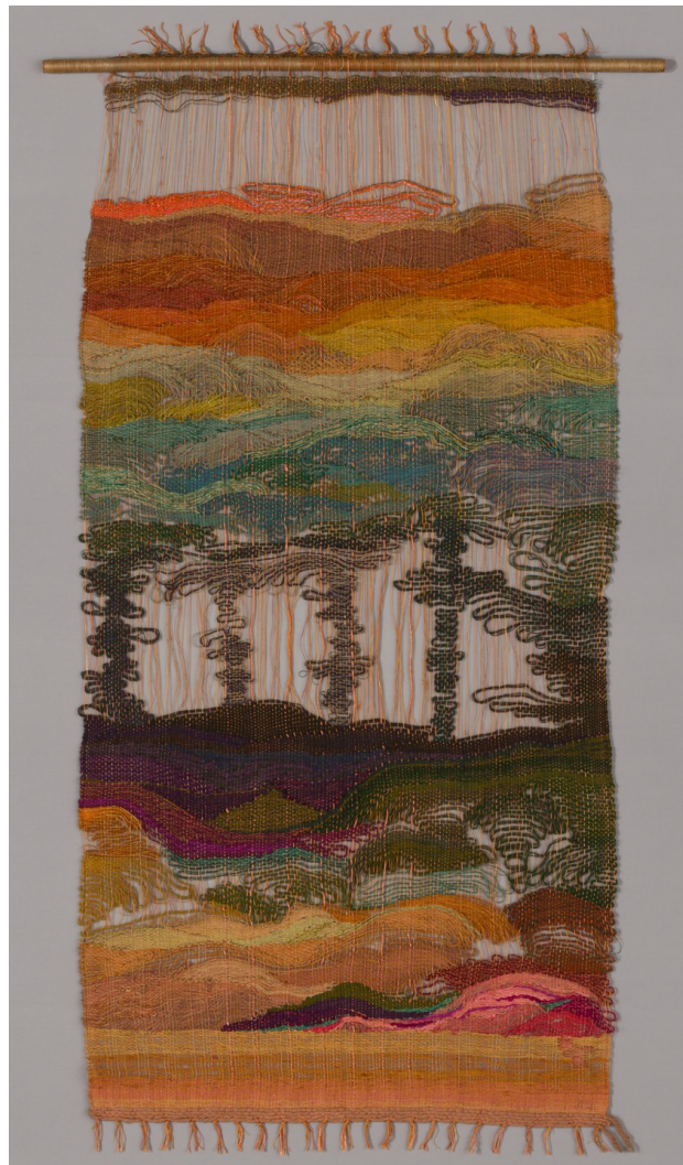
Figure 4 Landscape

Note. Lenore Tawney. Landscape . 1958. Silk, cotton, bast fibers, and rayon, plain weave with discontinuous wefts and exposed warps; knotted warp fringe over wooden pole wrapped with linen, plain weave. CC0 Public Domain Designation (Tawney).