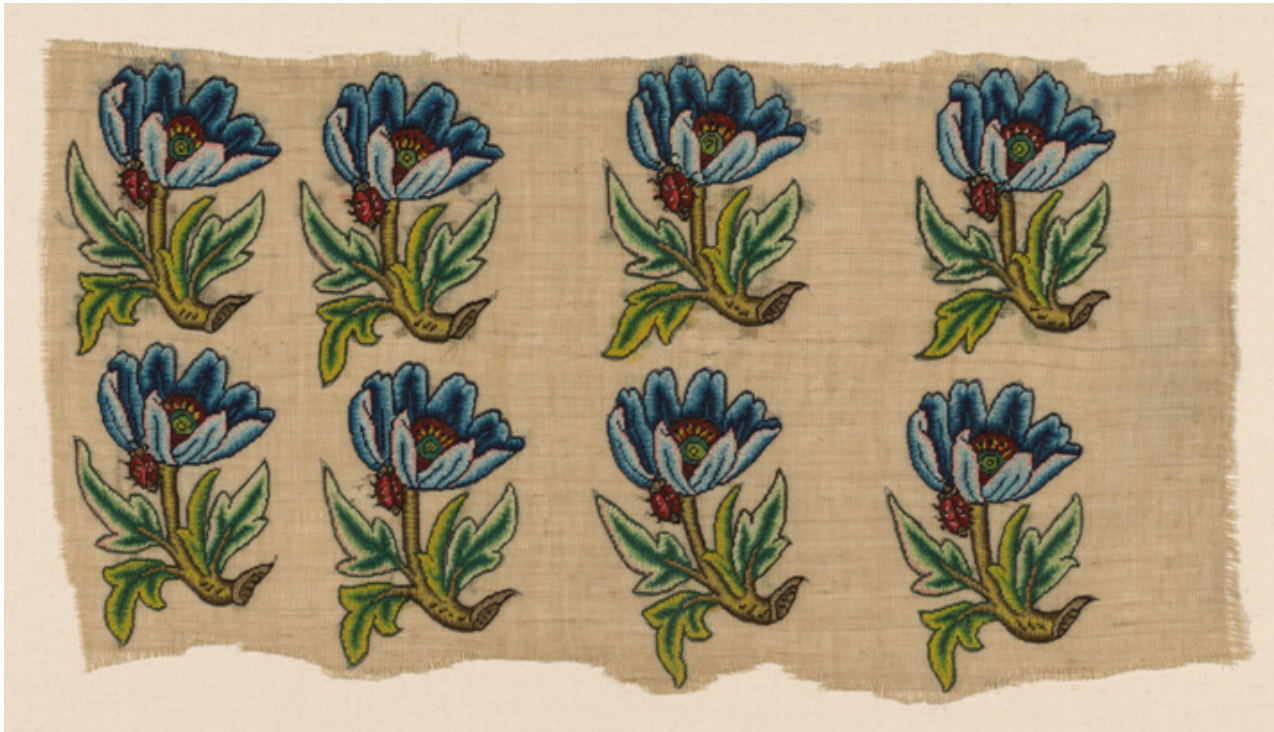
Panel of Uncut “Slip” Designs

Note. Made 1625-1675. England. Hemp, plain weave; embroidered with silk in tent stitches. 28.4 × 53.9 cm (11 1/4 × 21 1/4 in.). The Art Institute of Chicago. CC0 Public Domain Designation.